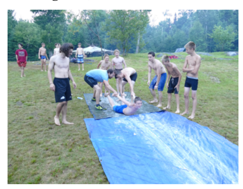
Rainstorms bring puddles and spontaneous games!