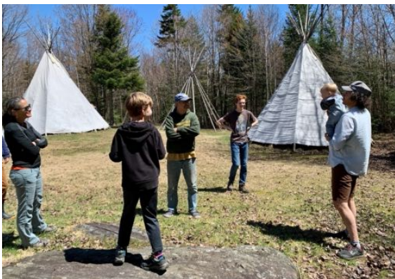
Job well done!

Thank you all for giving your time to help prepare Night Eagle for the summer of 2023. It was great seeing old friends and meeting new campers and parents. All of you are vital to the existence of Night Eagle, and we really do appreciate all that you do for camp! Pilamaya!