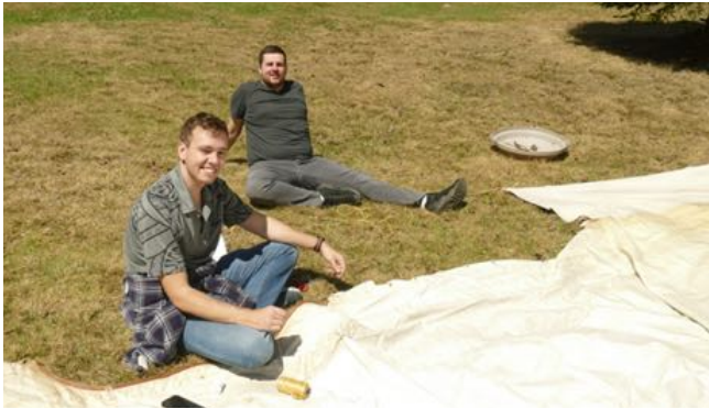
Red Path Seeker and Blue Heron - tipi repair

brought down three days the previous week, taking down and storing the sweat lodge, and repairing the Black Bear Buffet at Skunk Junction.