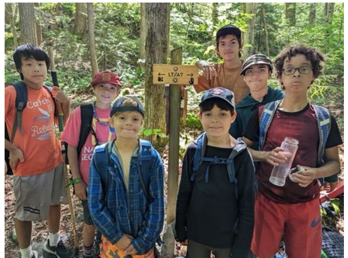
Otter Path and a group of hikers on the AT/LT

If you want to complete a complicated craft project at Night Eagle , you'll have to work at it, and that will take time from other activities. If you're going to eat three meals a day, you're going to have to do your share on cook crew. That, too, will take time. If you want to perfect your canoe strokes, you won't be able to unless spend time out in a canoe, and that will take time also.