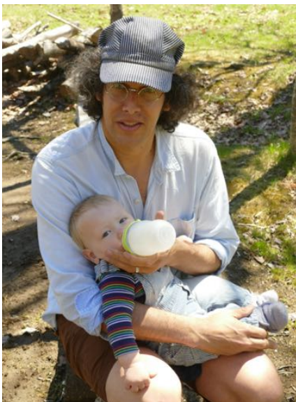
Time for a break! These people are wearing me out