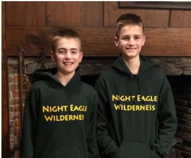
Drum Spirit and Circle Singer model the first edition of the Night Eagle sweatshirt

Sizes: Youth small, medium, large; Men's small, medium, large, X Large.