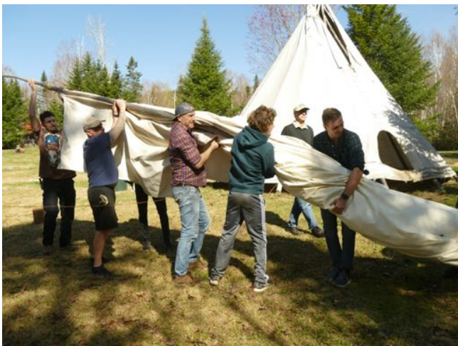
Up she goes!